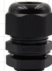
NPT TYPE Material: Nylon