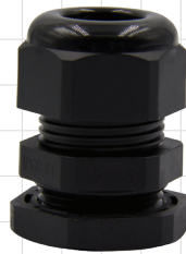
PG TYPE Material: Nylon PA, UL94-V0