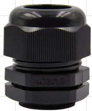
METRIC TYPE Material: Nylon