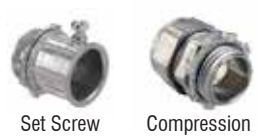
Set Screw Compression