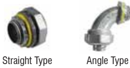
Straight Type Angle Type