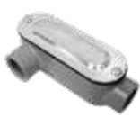
LR Sizes: 1/2"-4"