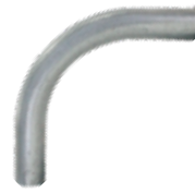
EMT Elbow 1/2"-2"