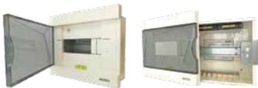
• 8/12/16/20/24/32 ways