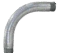
RSC Elbow 1/2"-4"