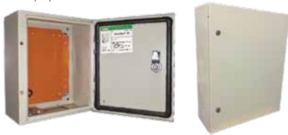
Powder Coated Nema 4,12, IP66