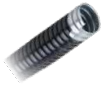
PVC-Coated Flexible Conduit