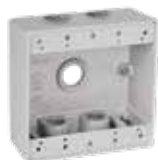
2 Gang (Aluminum Die-Cast)