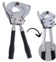
MGC70A (for SWA)