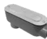
LB Sizes: 1/2"-4"