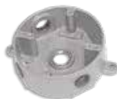
4" Round Box (Aluminum Die-Cast)