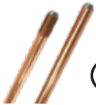
Copper Bond Ground Rod