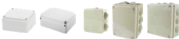
IP65, ABS Material