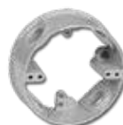
Round Extension Ring