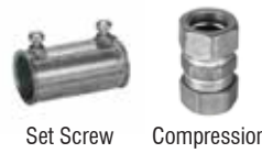
Set Screw Compression