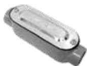
C Sizes: 1/2"-2"