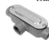
T Sizes: 1/2"-2"