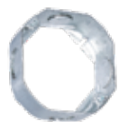
Octagonal Extension Ring