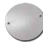
Round Cover (Zinc Die-Cast)