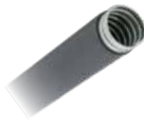
Liquidtight Flexible Conduit