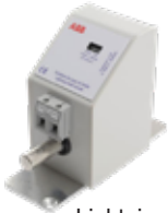
Lightning Strike Counter