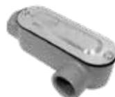
LL Sizes: 1/2"-2"