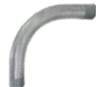
IMC Elbow 1/2"-4"