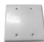
2 Gang Cover (Zinc Die-Cast)