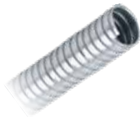
Steel Flexible Conduit