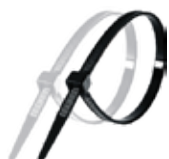
UV Protected Cable Ties (Black) Standard Cable Ties (White)