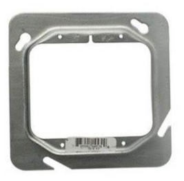
4" x 4"